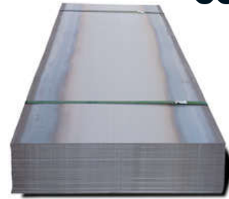
Lámina y Placa Comercial offers hot-rolled sheet and plate for different applications with a wide range in different dimensions and steel grades, besides extending excellent service, quality and delivery time.